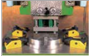
Ürün Nr. 1168 Kombine Bağlama Pabucu Product Nr. 1168 Combined Clamp