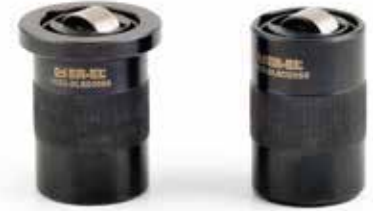
Ürün Nr. 1022 Yaylı Silindir Kalıp Kaldırma Model DLS Product Nr. 1022 Die Lifter Spring Cylinder Model DLS