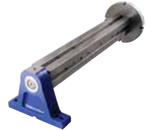
Yatak = Nr.2460