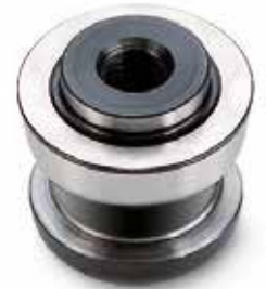
Product Nr. 0900 5-Axis Clamping Block Puller Bolt