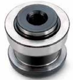
Product Nr. 0900 5-Axis Clamping Block Puller Bolt