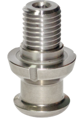
Product Nr. 1065 Pull Stud